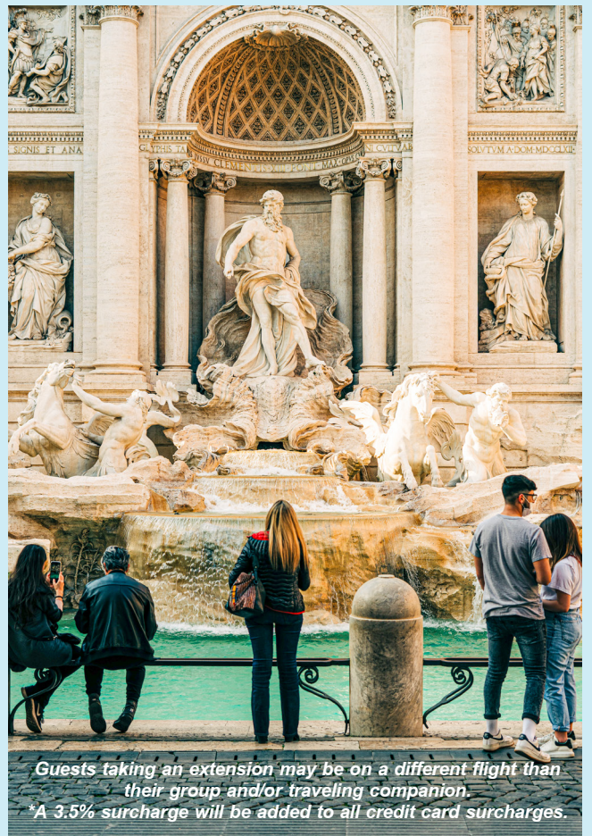
Guests taking an extension may be on a different flight than their group and/or traveling companion. *A 3.5% surcharge will be added to all credit card surcharges.

Bid farewell to Rome as you transfer to the Rome airport this morning for your return flight to the USA.